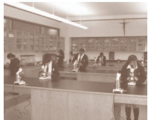
Before and after pictures of the science lab ($40,000 grant) at St. Elizabeth School in Manhattan.