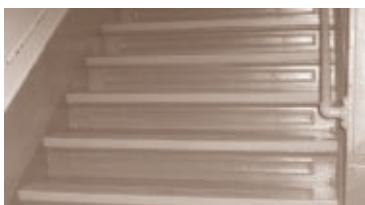
Before and after pictures of stairwell treads ($45,000 grant) at Our Lady of Pompeii School in Manhattan.