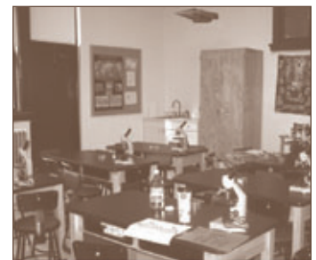
Before and after pictures of science lab renovation ($47,500) at Our Lady of Lourdes School (Manhattan).