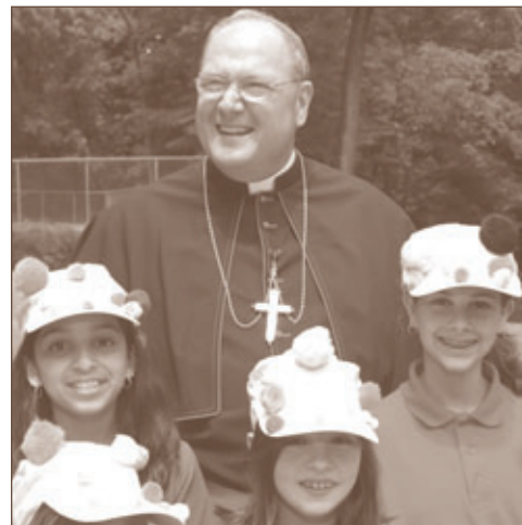
Archbishop Timothy Dolan.

A St. Louis native, Archbishop Dolan is no stranger to Catholic education. He attended Holy Infant Grade School in Ballwin, Missouri, followed by St. Louis Preparatory Seminary and Cardinal Glennon College, before being ordained as a priest in 1976 for the Archdiocese of St. Louis. Archbishop Dolan then went on to earn a doctorate in Church History from The Catholic University of America in Washington, D.C., served as a faculty member at Kenrick-Glennon Seminary and as rector of the Pontifical North American College in Rome.