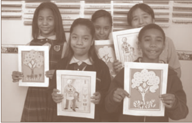
St. Jerome School students proudly display their picture books.

As the culmination of a year of writing, students in grades four through seven from five Inner-City Elementary Schools wrote and published picture books based on their own personal narratives.