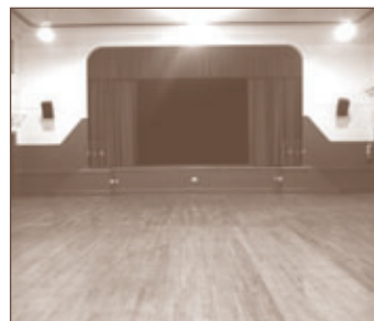
Before and after pictures of gym and stage renovation ($50,000) at Our Lady of Mercy School (Bronx).