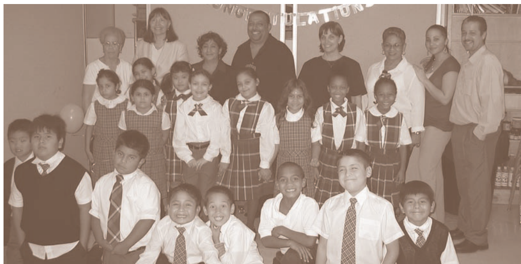
Our newest Community Connections students celebrate their scholarships with their school principals and staff from East Harlem Tutorial Program.